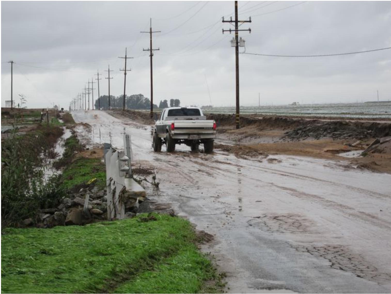
Alisal Road heading out into unincorporated Monterey County was largely flooded Friday morning.