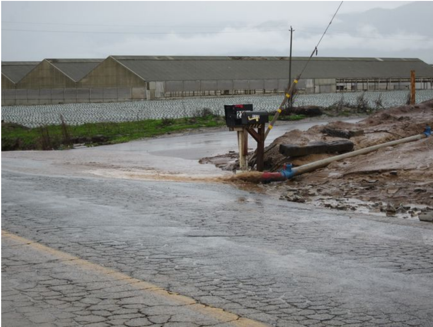
A storm drain washes out Friday morning onto Alisal Road.