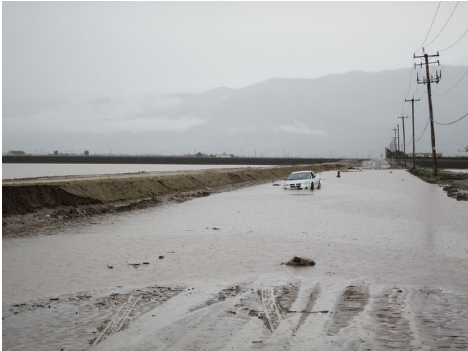
A small passenger vehicle sat abandoned Friday morning in the middle of moving water on Hartnell Road.