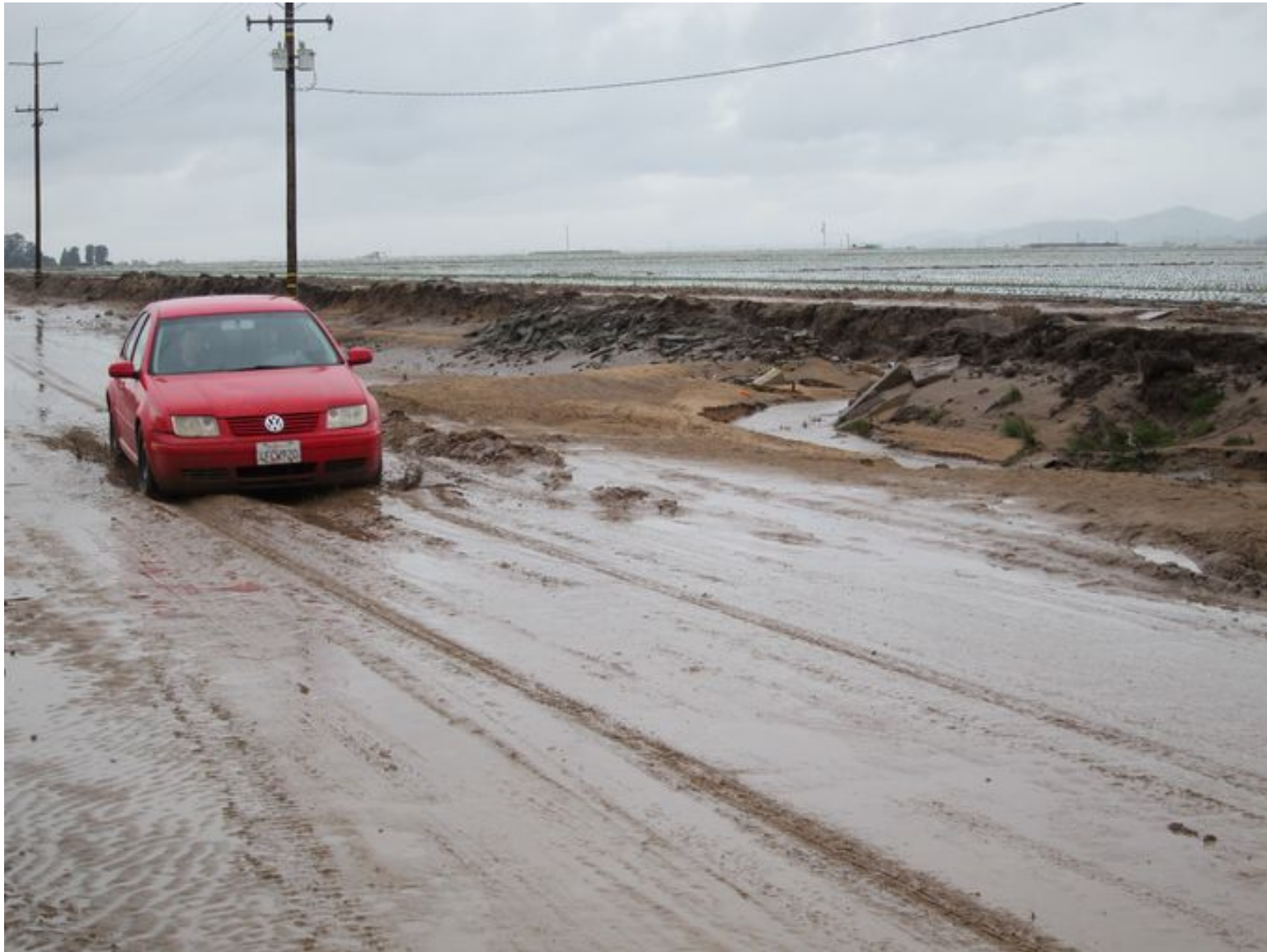
Alisal Road heading out into unincorporated Monterey County was largely flooded Friday morning.