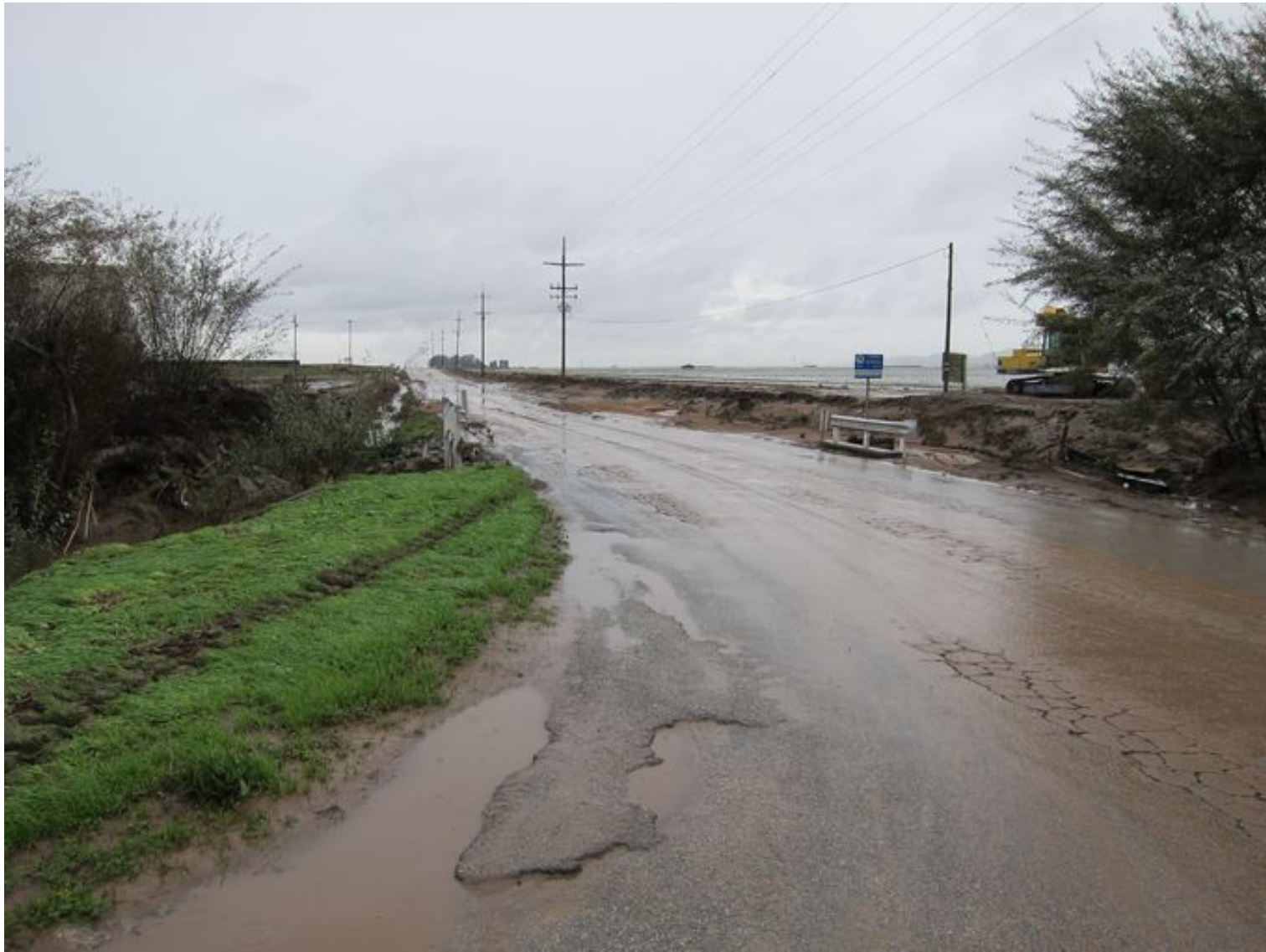
Alisal Road heading out into unincorporated Monterey County was largely flooded Friday morning.