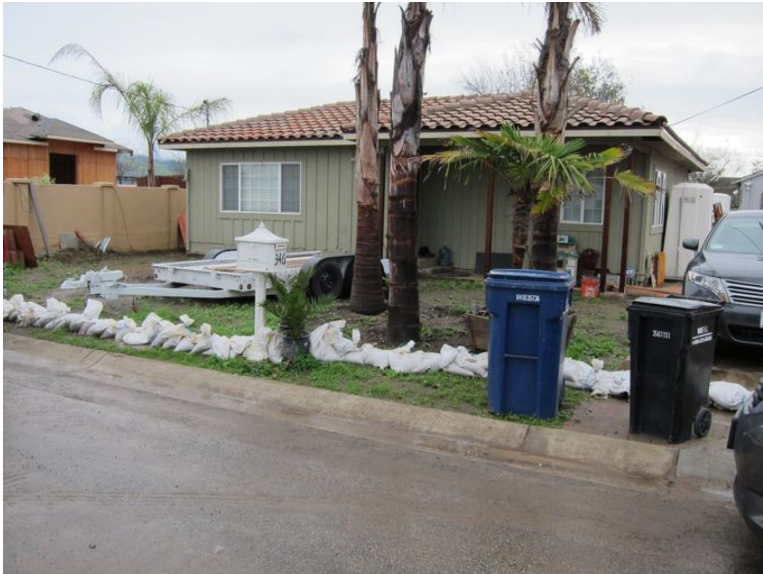
Sand bags outside this Paul Avenue house may have spared it the worst of Thursday's flooding. Nearby residences were still surrounded by water Friday morning.