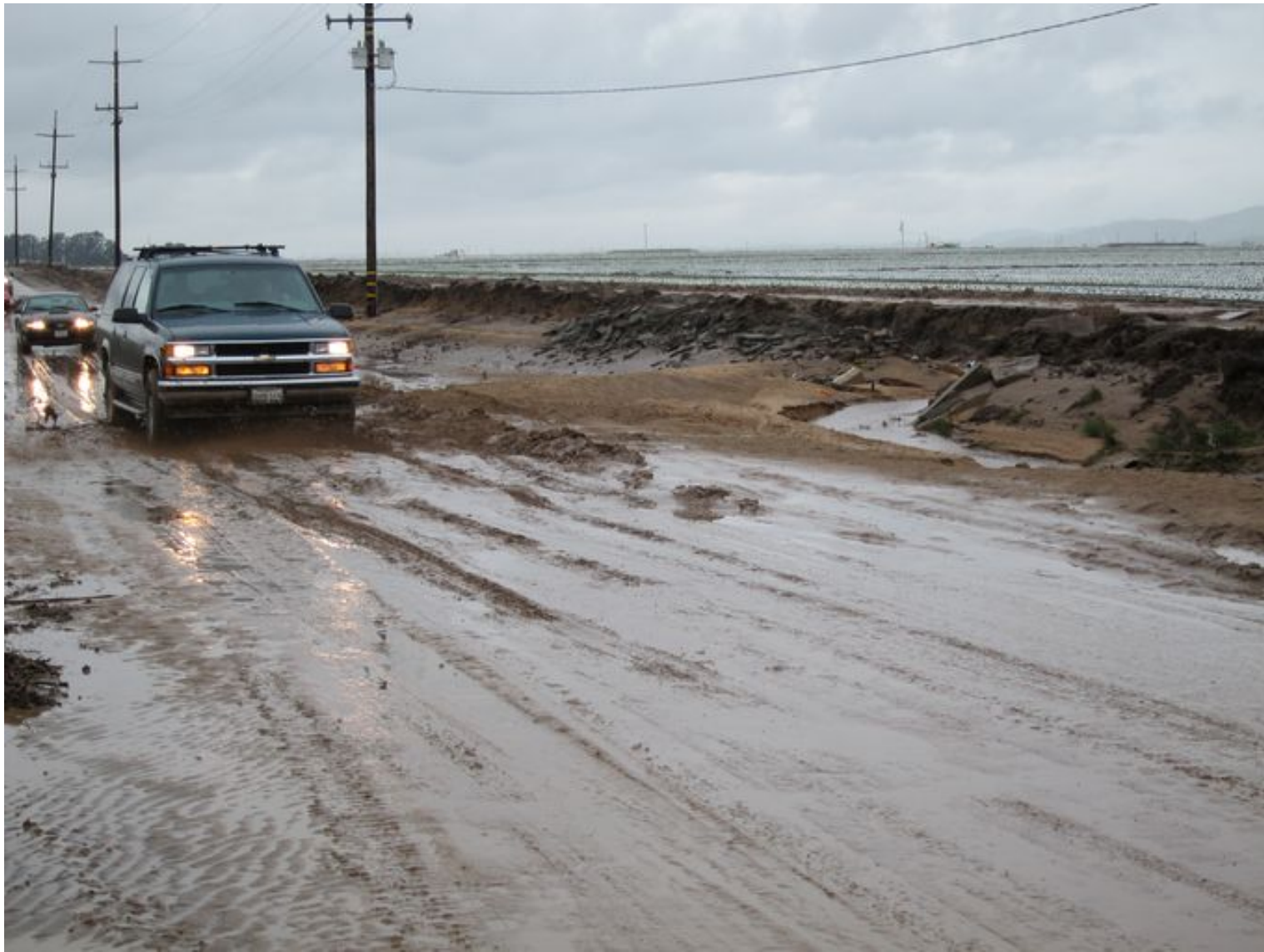
Alisal Road heading out into unincorporated Monterey County was largely flooded Friday morning.