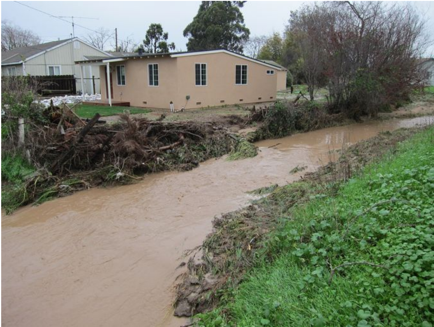
Santa Rita Creek was overwhelmed Thursday following a huge storm. Homes on nearby Russell Road were evacuated after the flooding. By Friday, the creek was still in turmoil.