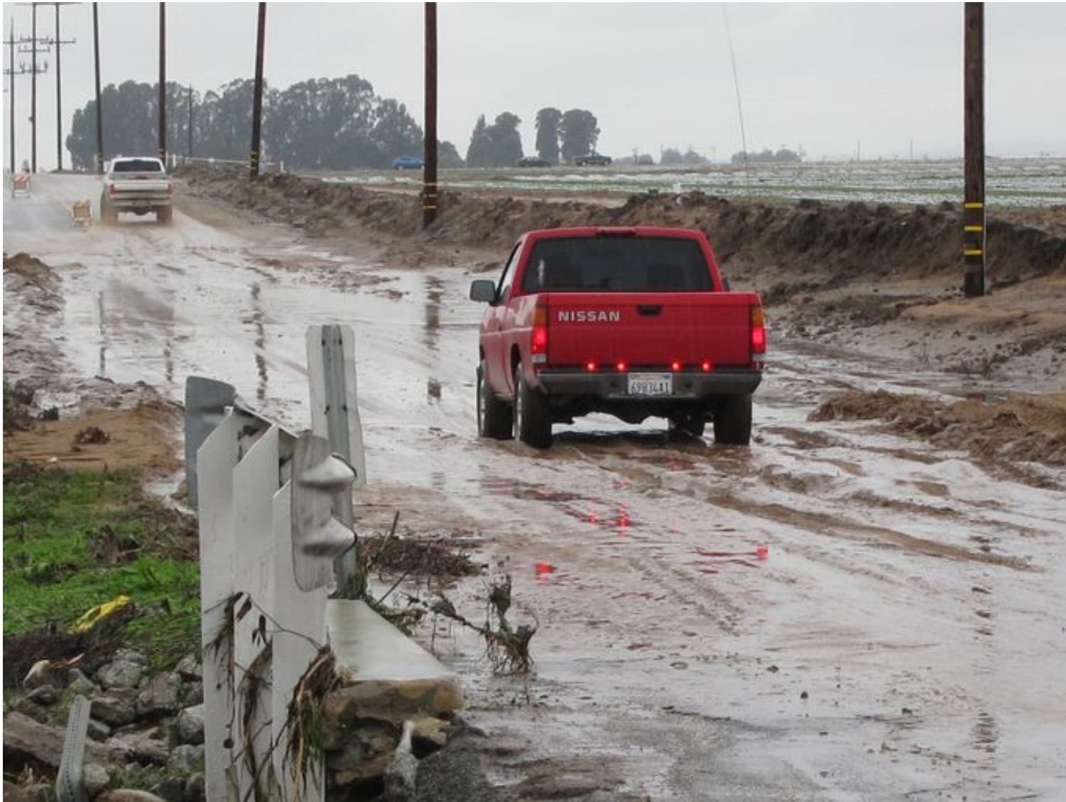
Alisal Road heading out into unincorporated Monterey County was largely flooded Friday morning.