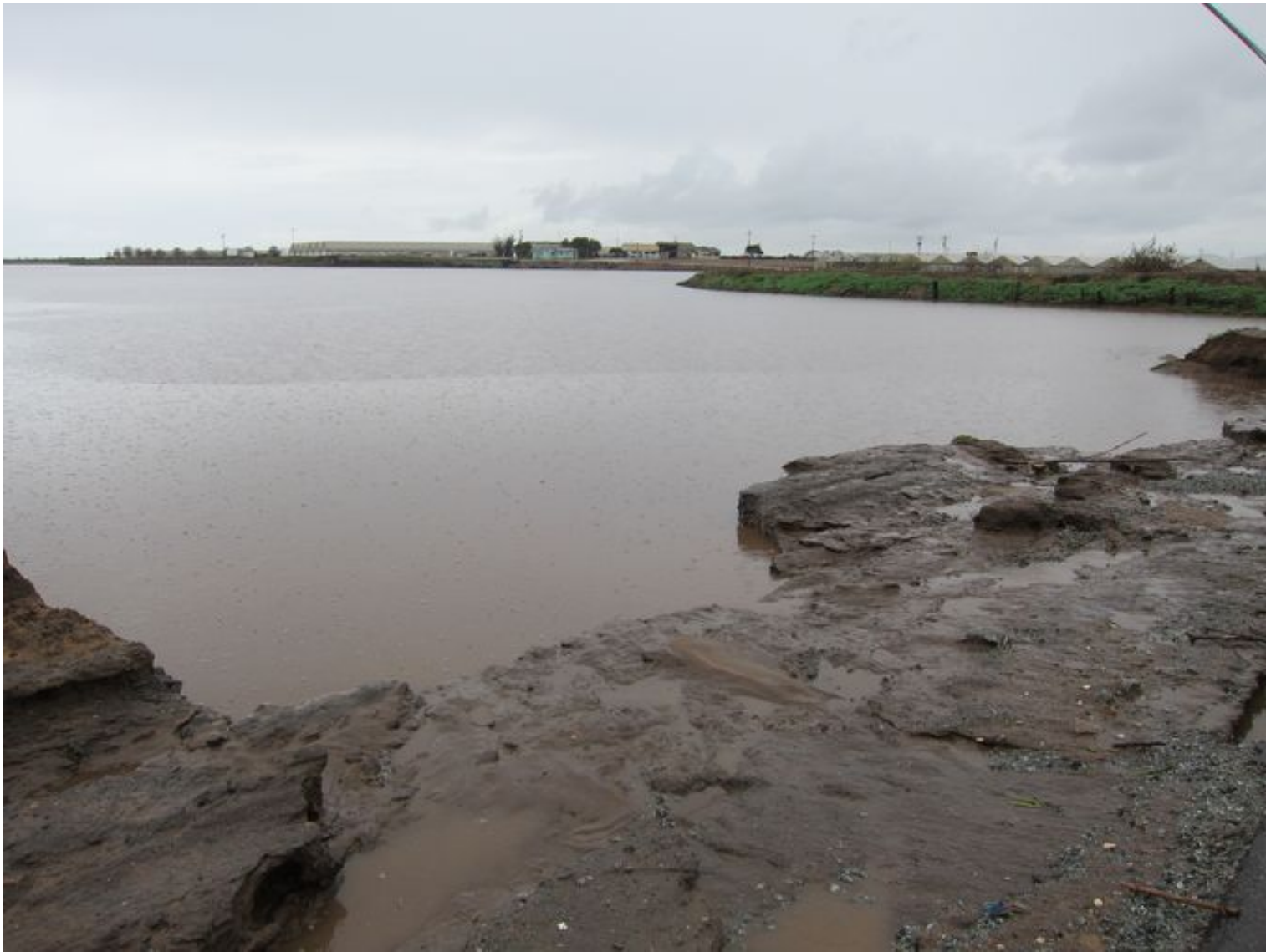
An agricultural field on Hartnell Road near Alisal and Gould roads remained flooded Friday morning.