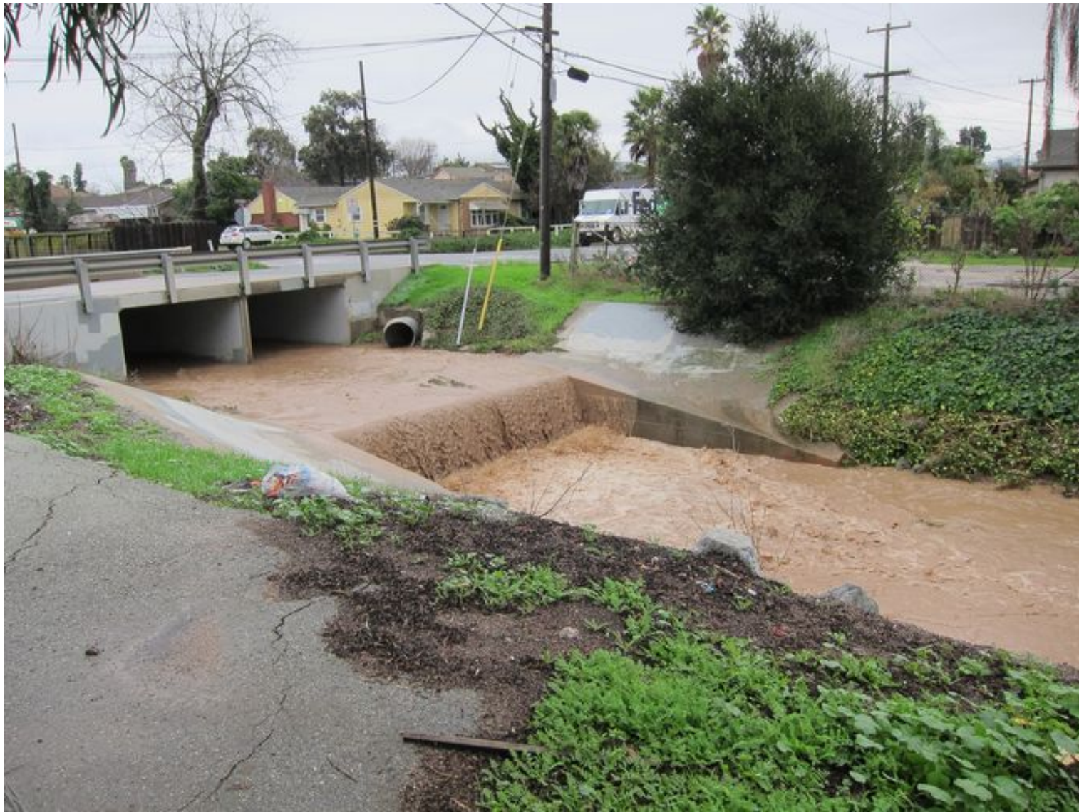
Santa Rita Creek was overwhelmed Thursday following a huge storm. Homes on nearby Russell Road were evacuated after the flooding. By Friday, the creek was still in turmoil.