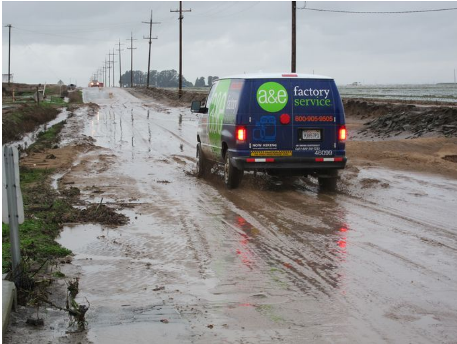
Alisal Road heading out into unincorporated Monterey County was largely flooded Friday morning.