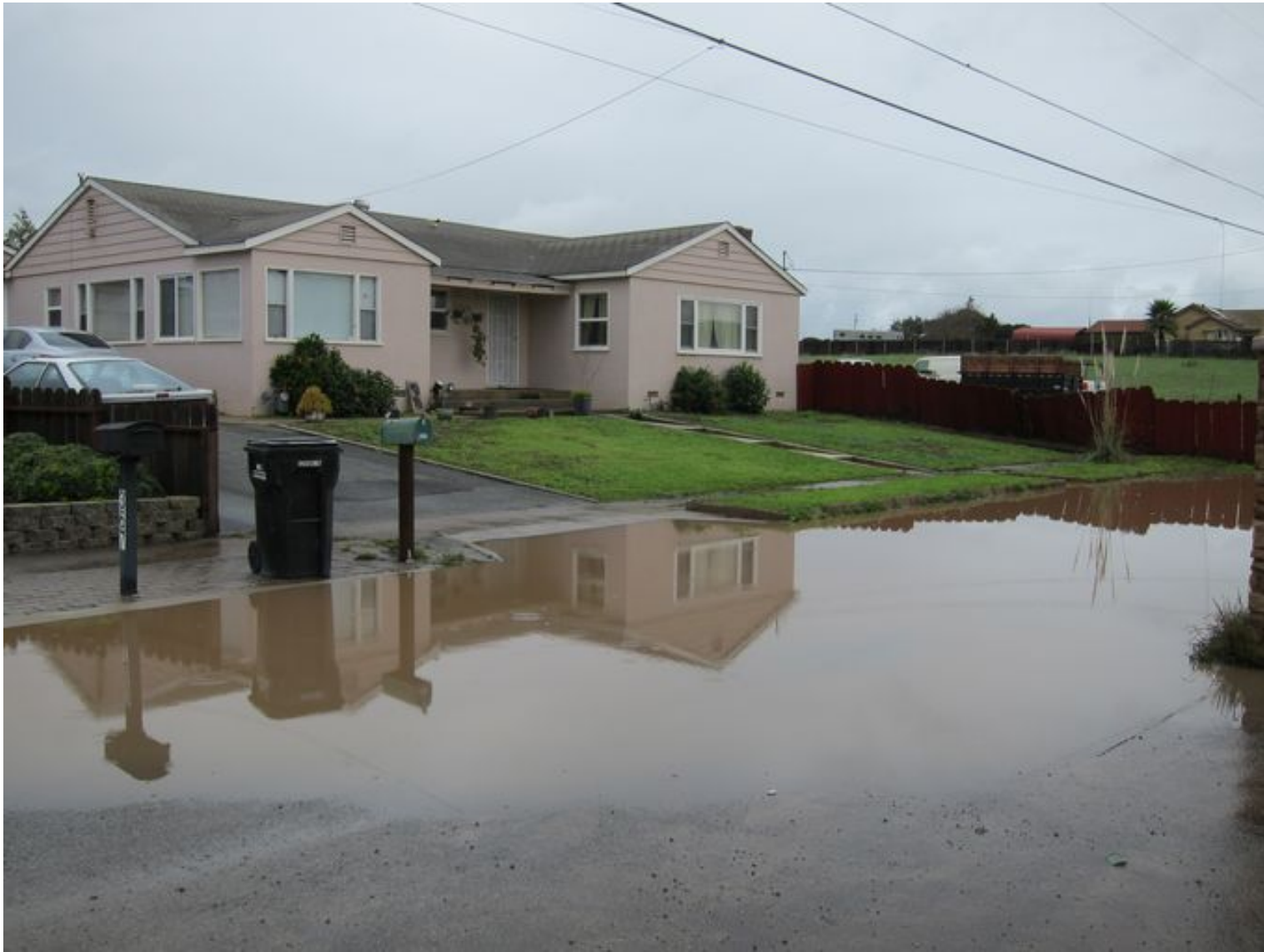
Homes on Paul Avenue were still surrounded by standing water Friday morning following Thursday's deluge.