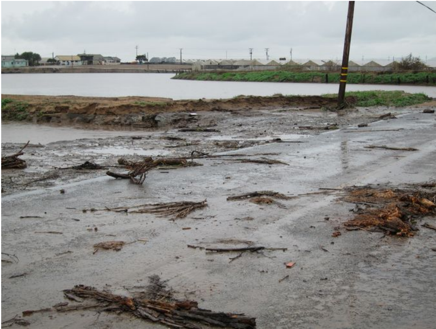
Friday morning, debris still coats a passable portion of Hartnell Road.